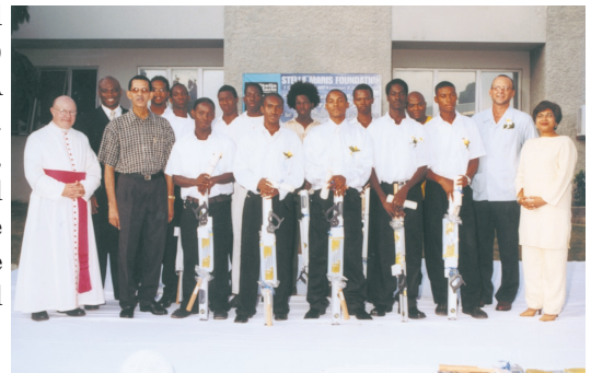
Stella Maris Foundation's Carpentry Graduating Class (Sept. 2003)

The Foundation has trained and graduated thirty two (32) students with the HEART NTA Pre-Level One Certification. Most recently (September 2003), fourteen (14) boys were certified in Cabinet Making, of which we (with the assistance of the (KRC) , we have already placed ten (10) in full time jobs.