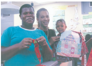
Students of the Sewing class displaying some of their work.

The first batch of students commenced training in May 2003 and ended February 2004. This marks the end of the Fund made possible by the Embassy of Japan.