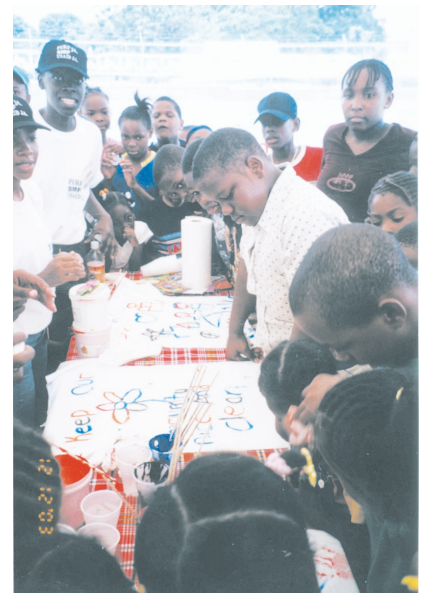
Youngsters painting messages of peace at the recently held pre-Christmas Bazaar at the Shortwood teacher's college. The collaborative effort of PERF and Stella Maris Foundation is funded by the USAID

The CEP seeks to facilitate the overall PERF effort aimed at reducing crime and violence by stimulating a new and positive relationship between the Community and the Police as well as strengthening the community's problem solving capacity.